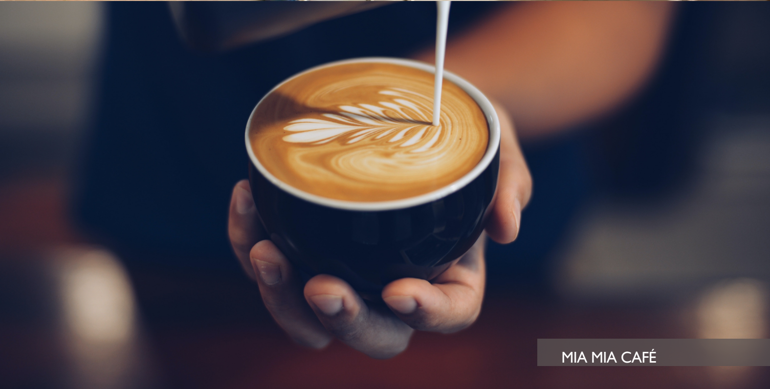
MIA MIA CAFÉ

Located on the ground floor and open every day from 7:00 AM to 11:00 PM