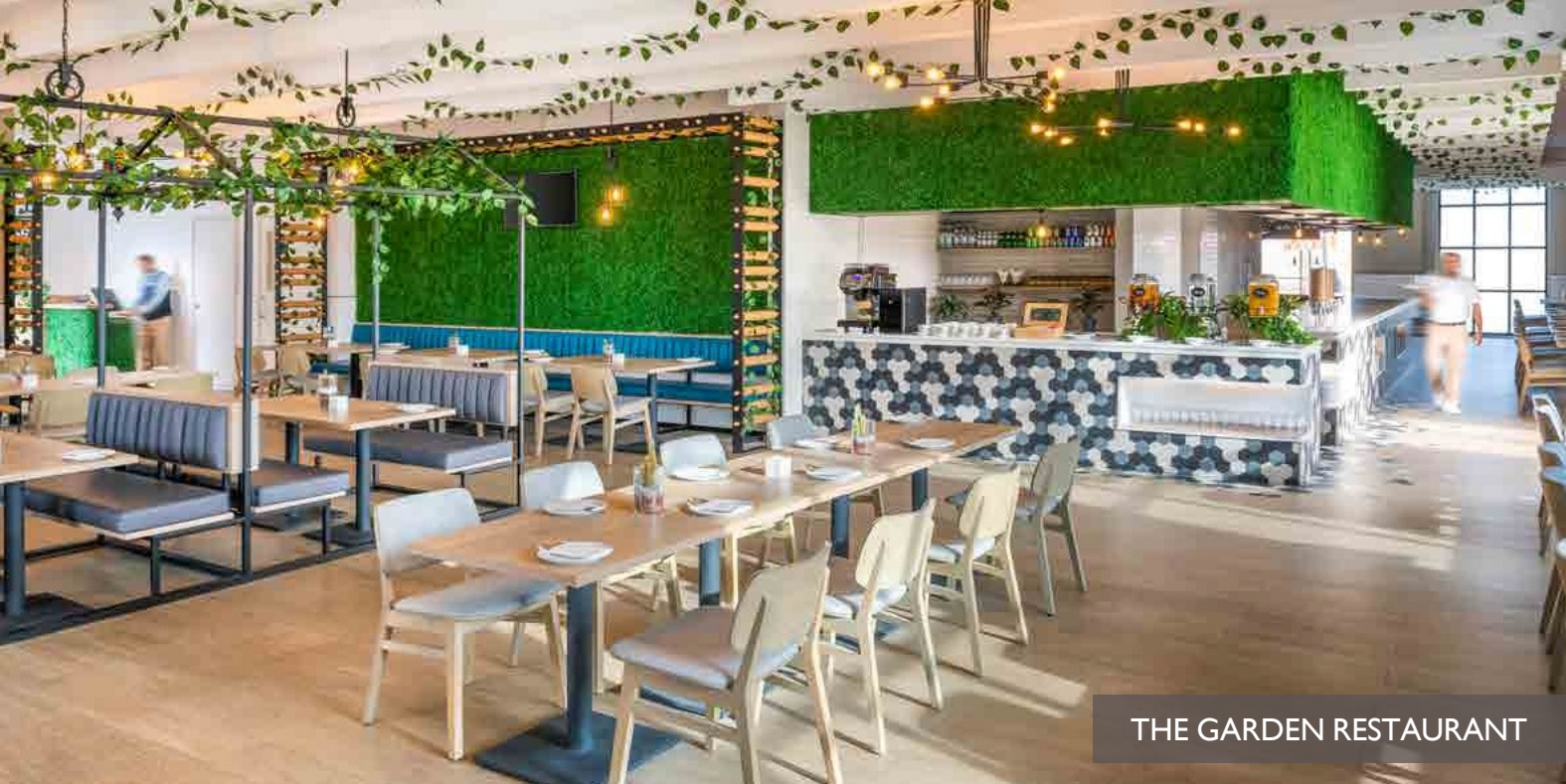
THE GARDEN RESTAURANT