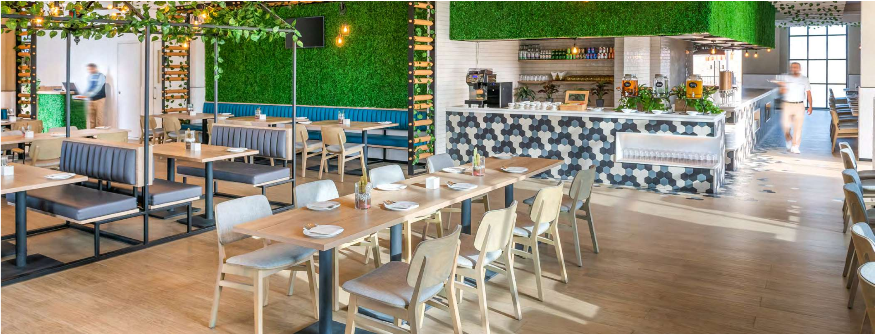
The Garden Restaurant