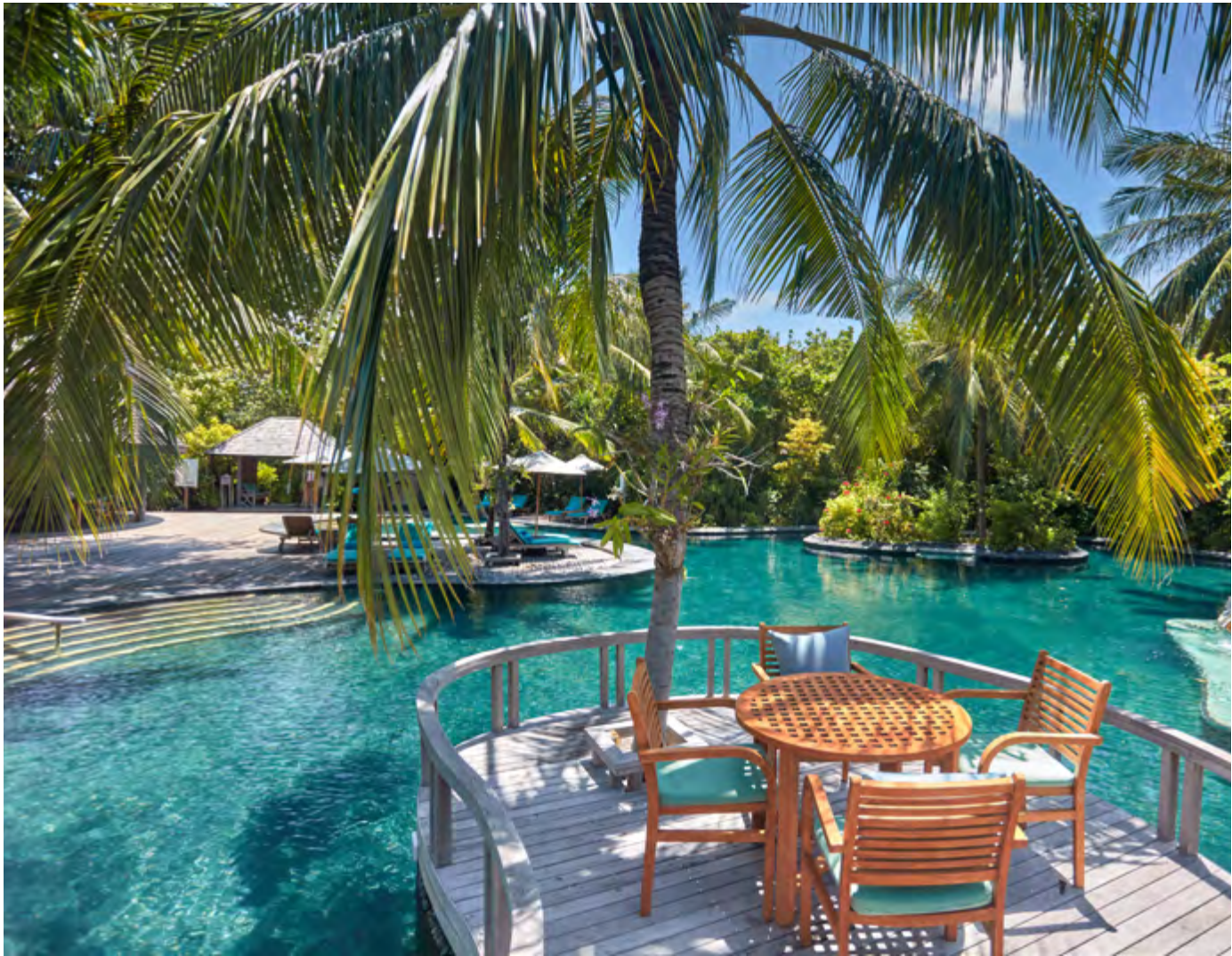
Andiamo Bistro And Pool