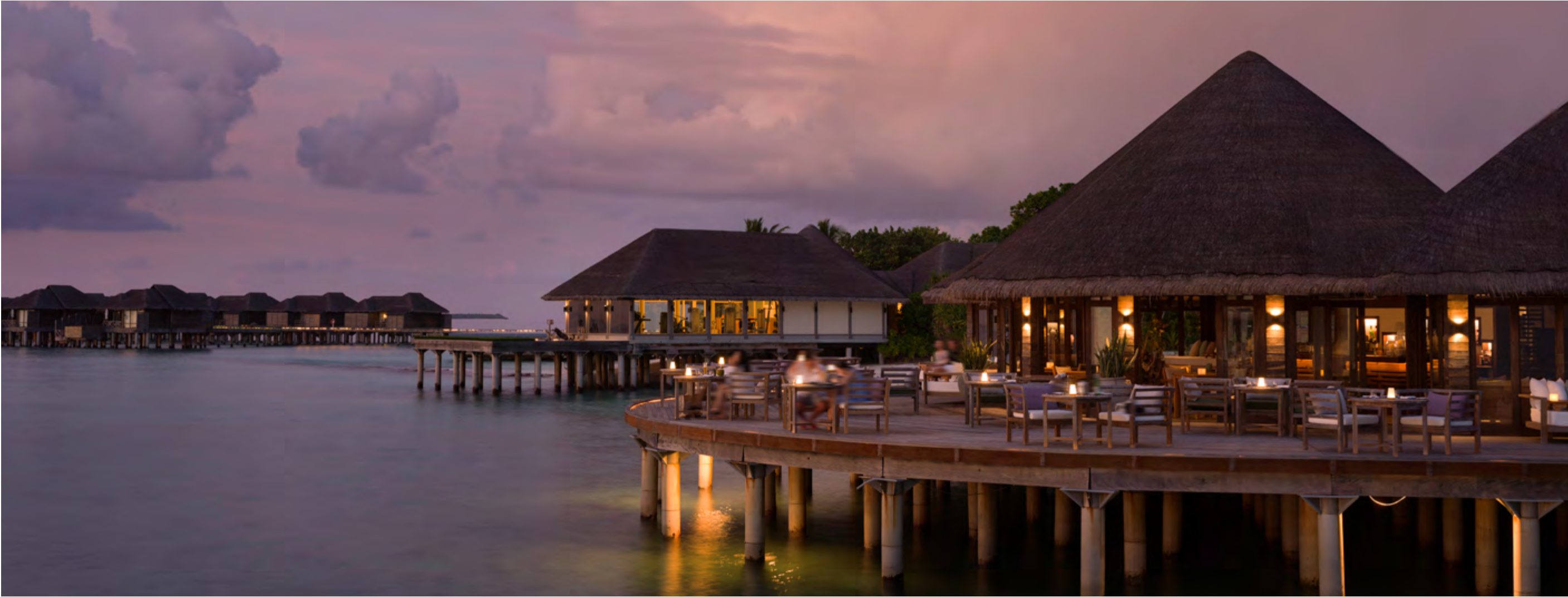
White Orchid Lounge