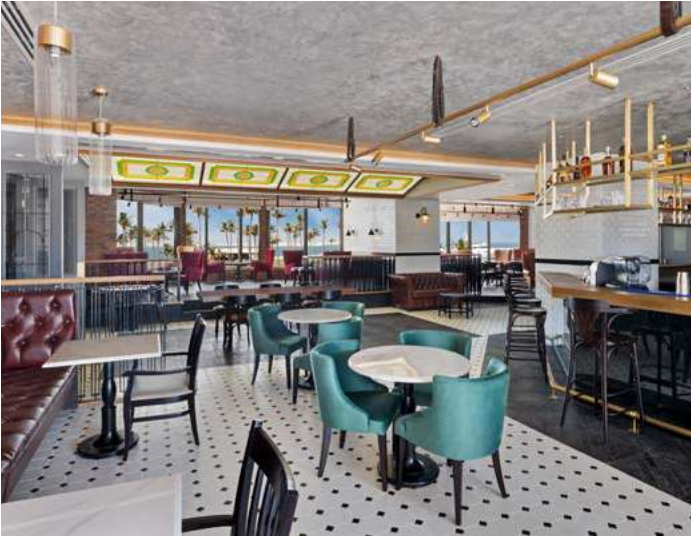
Vasco Da Gama