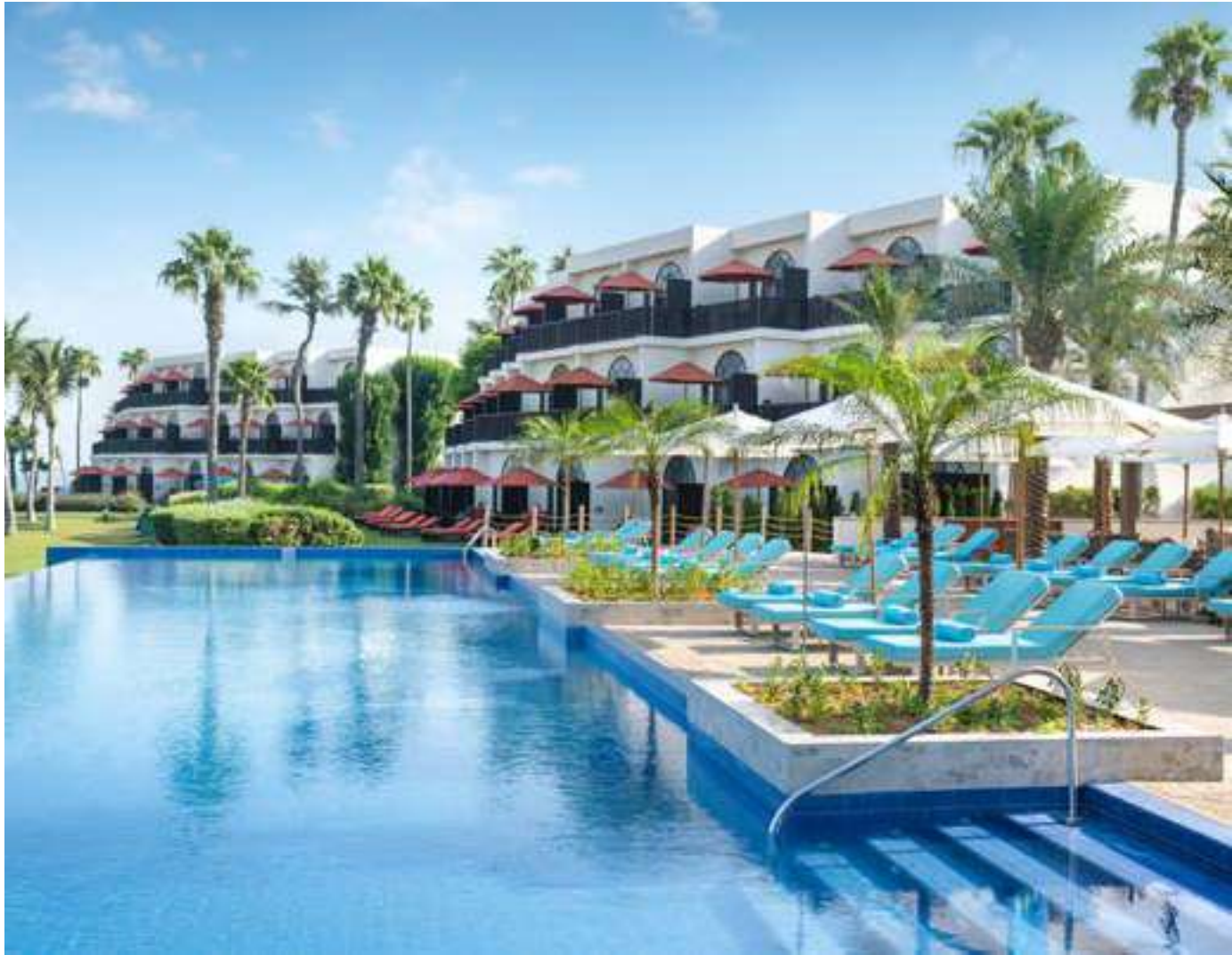
Tamr Pool Bar