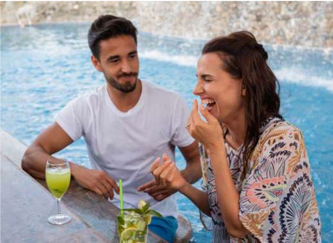
La Fontana Pool Bar

Soak up stunning beachfront views and sample delectable drinks. A superb spot for cooling off away from the heat or unwinding with a sundowner, promising variety of thirst-quenching cocktails, mocktails and milkshakes.