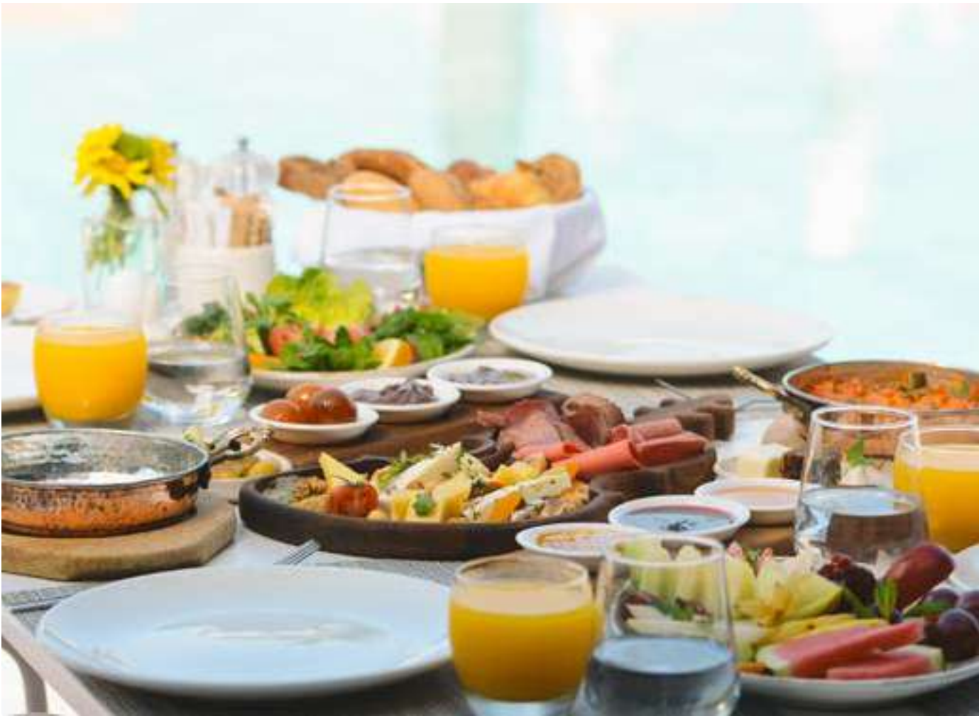
La Fontana Brasserie

Luxury buffets don't get any grander, overlooking one of the resort's swimming pools, the friendly restaurant serves generous international buffet breakfast, lunch buffet and dinner with live stations.