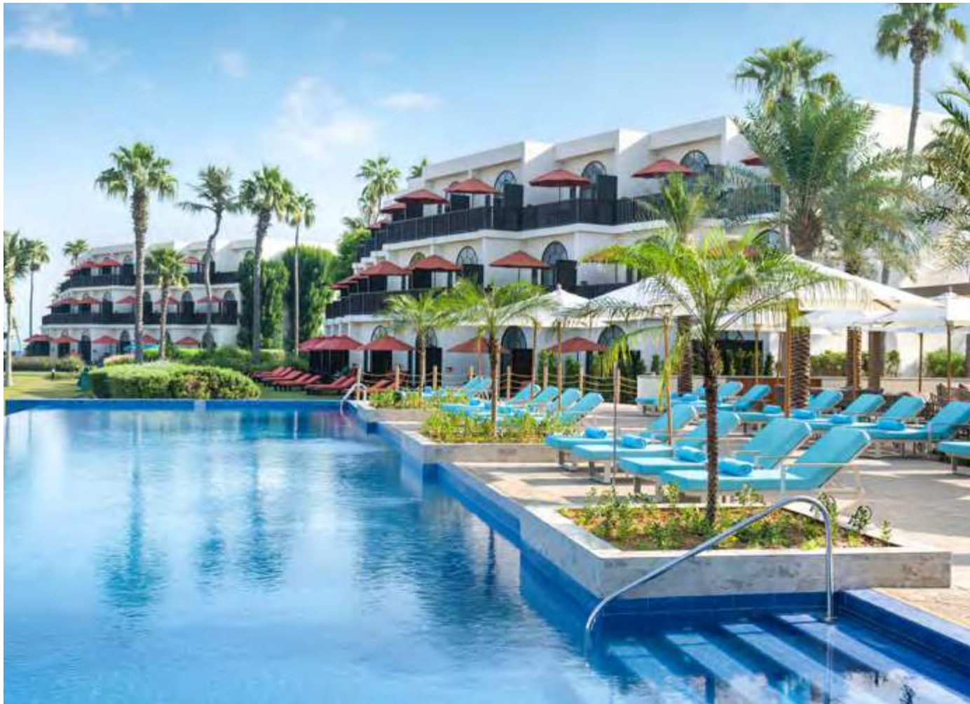
Tamr Pool Bar