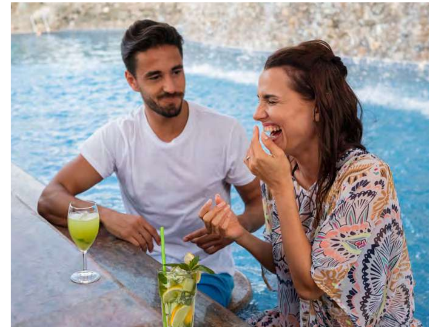
La Fontana Pool Bar