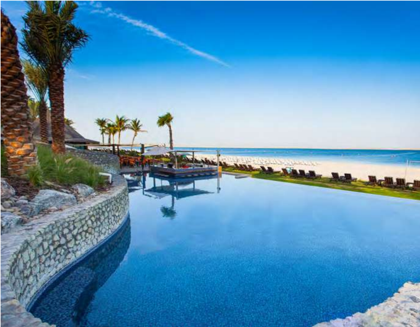
Palmito Pool Bar

This casual and fun venue is the ideal place for refreshing drinks and live entertainment. Located in the lobby at JA Beach Hotel, Vasco Da Gama offers a diverse range of signature cocktails, hops and more. Enjoy a refreshing drink under the stars or enjoy a game of giant chess on the expansive outdoor terrace.