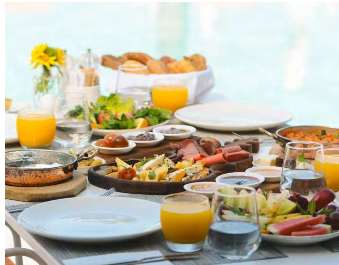
La Fontana Brasserie