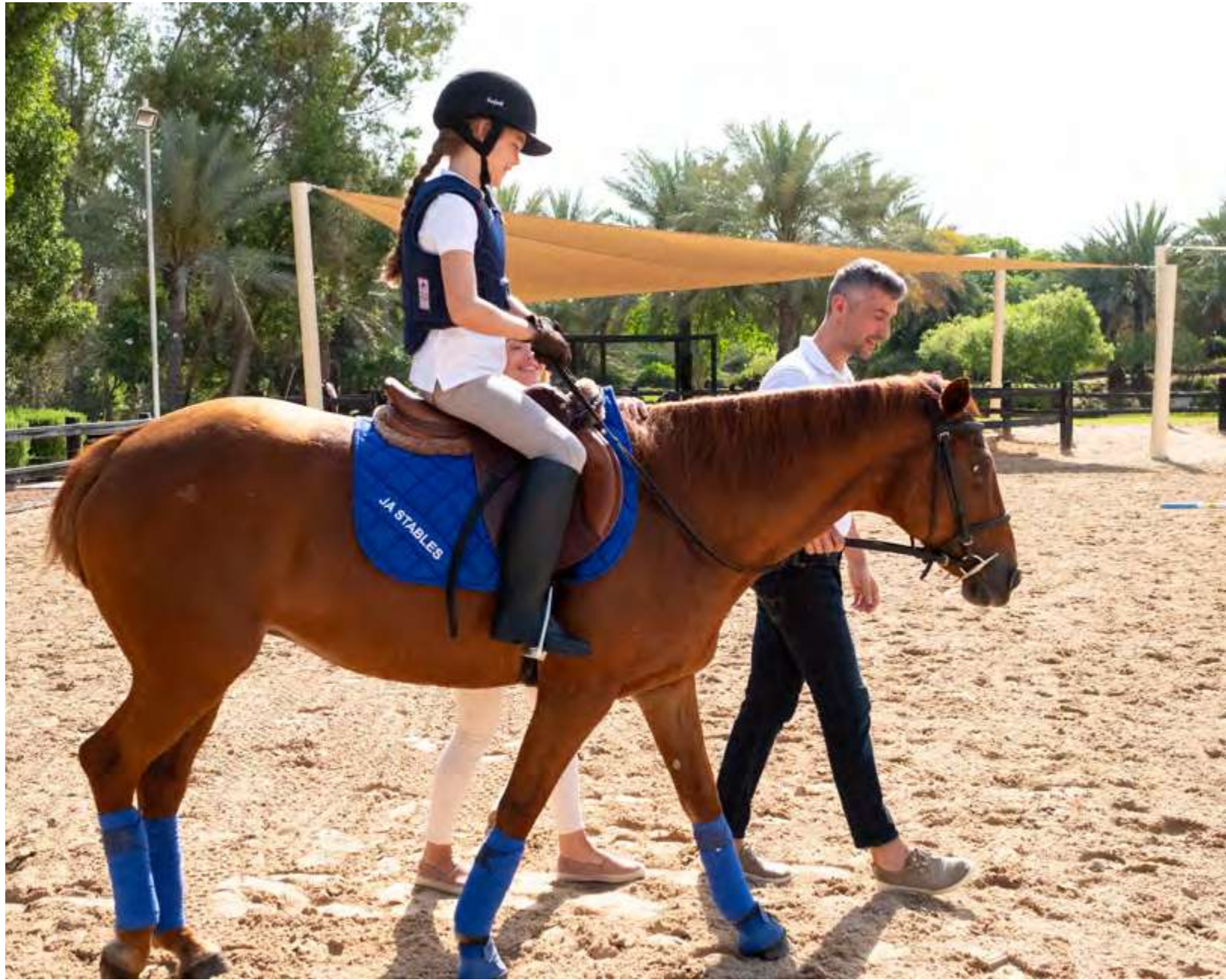
JA PALM TREE COURT